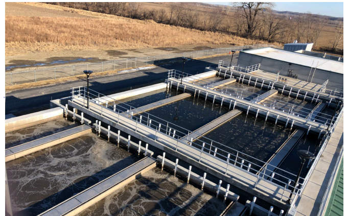
AquaNereda ® system at Wolcott WWTP

The UG partnered with HDR and pursued a Construction Manager at Risk (CMAR) delivery method with Garney Construction for greater flexibility, cost transparency, and accelerated delivery. A number of treatment technologies were evaluated including conventional activated sludge (CAS), fixed-film, and SBR options. The technologies were compared against the UG's goals for a compact footprint, increased capacity, future permit requirements, and a low cost of ownership.