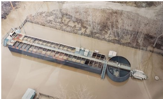
Original package plant during a flood event at Wolcott WWTP

The 200,000 gpd package plant proved suitable for about a decade until population trends continued to demand more capacity. The plant's location in a floodplain also made maintaining operation during heavy rainfall challenging. Flooding of the Missouri River in 2019 not only caused electrical problems but also access issues. A new plant would need to provide a 10x capacity increase and nutrient removal capabilities but also offer a compact footprint as the site would need to be raised out of the floodplain.