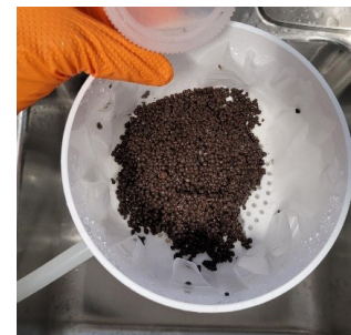
Granules at Wolcott WWTP

The UG seeded their AquaNereda reactors with CAS from one of their nearby plants in January 2022. Effluent compliance was achieved with one week of startup, including superb nutrient removal results. The site saw a significant improvement in sludge settleability with granules developing in less than a month.